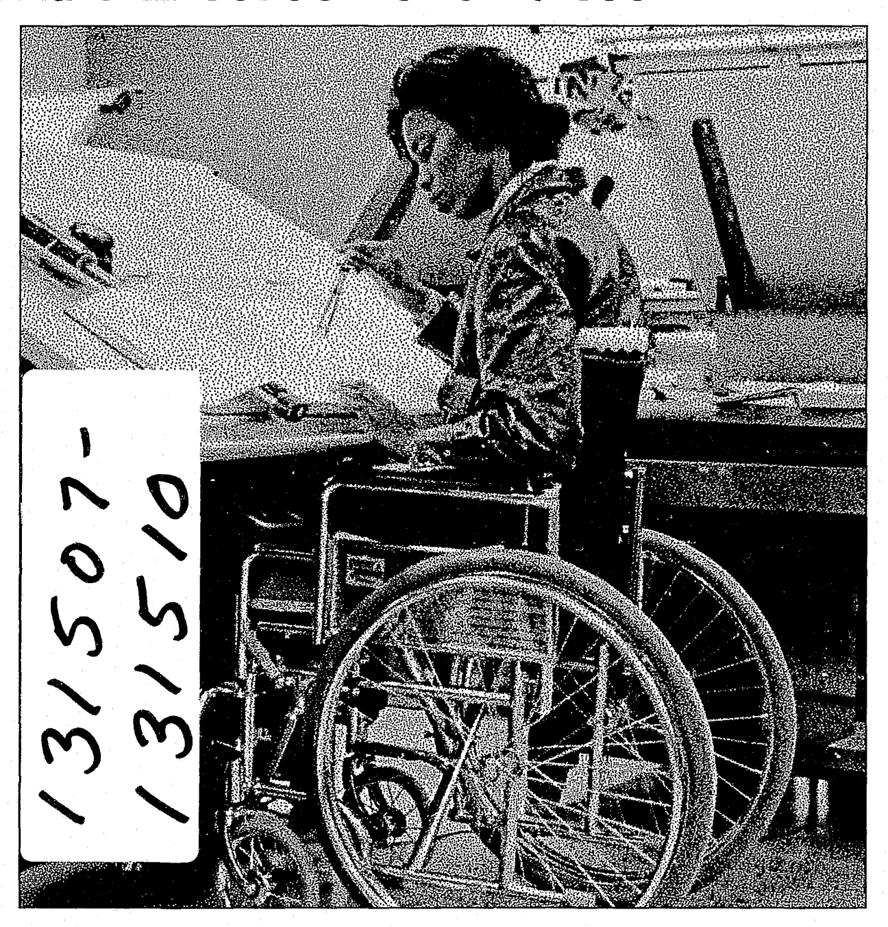
The Americans with Disabilities Act