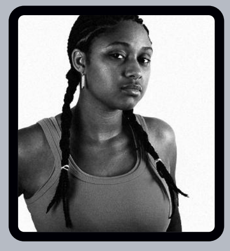
What you were wearing.