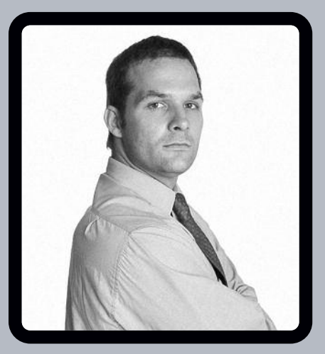
Whether you are male or female.

For a sexual assault victim, being believed and supported does matter. Whether you choose to report it or not, we can help.