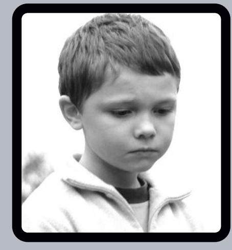
What you were doing.