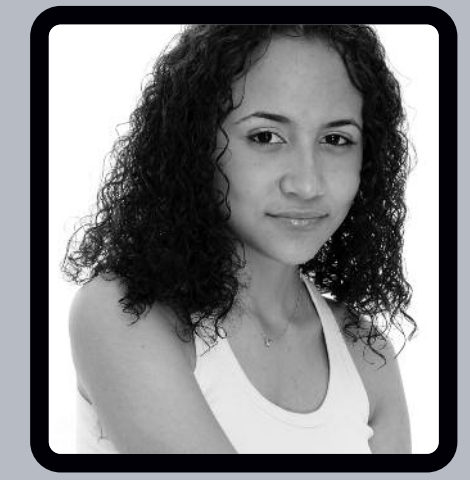
Whether you were drinking.