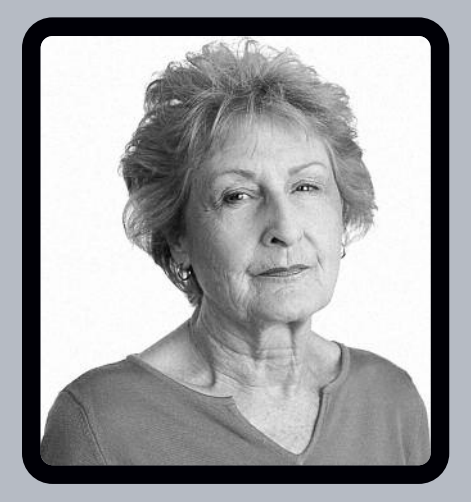
What your sexual orientation is.