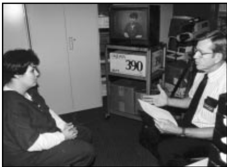
A life skills instructor videotapes a mock job interview with an inmate.

education to the facility's offerings to occupy inmates until a vocational slot opens up. Despite these shortcomings, few inmates experience delays or downtime.