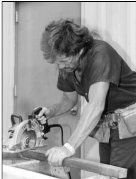
An inmate practices basic carpentry skills in the Phoenix facility vocational program.

Do inmates who may feel coerced into participating in educational and vocational programs learn anything? Several inmates think so, reporting that, while they would not have participated if it were not for the incentives, they were glad they did. As one inmate said, "Guys are angry when they get here [in the jail], so they don't want to take programs, but the classes turn out to be interesting and valuable. So it's good they force you to take them. When you come in, you're not thinking about programs, but then you start working them and you learn from them." There is also clinical evidence that individuals subject to compulsory drug abuse treatment have reduced criminal recidivism rates. 4 Finally, regardless of their motivation, hundreds of inmates in the Orange County jail have earned their general equivalency diploma (GED).