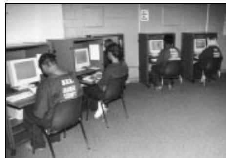
Women inmates in the Horizon facility life skills course use computers to pursue topics of interest at their own pace, such as job search techniques and money management strategies.

Focus on core competencies. The jail focuses first and foremost on providing inmates with basic reading skills. For example, the vocational programs devote time to raising inmates’ TABE