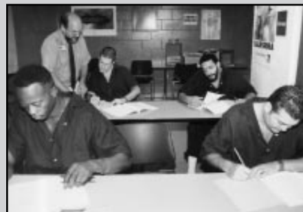
An instructor helps inmates prepare for their general equivalency diploma (GED) exam.