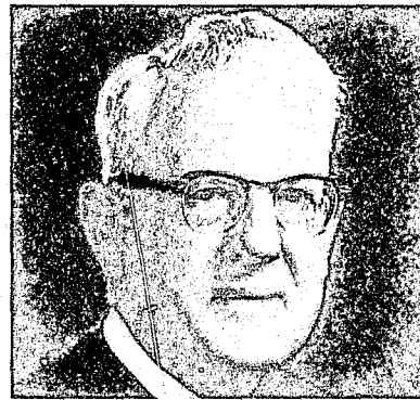
HONORABLE LLOYD E. GRIFFIN Presiding Justice, Court of Appeal San Diego October 1964 - February 1965