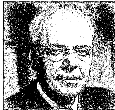
HONORABLE MURRAY DRAPER Presiding Justice, Court of Appeal San Francisco February 1967 - December 1973