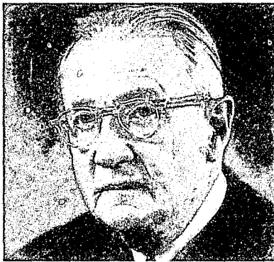
HONORABLE A. F. BRAY Presiding Justice, Court of Appeal San Francisco March 1961 - September 1964