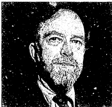
HONORABLE CHARLES E. GOFF Judge of the Municipal Court San Francisco Appointed February 1981 Present term expires January 1988