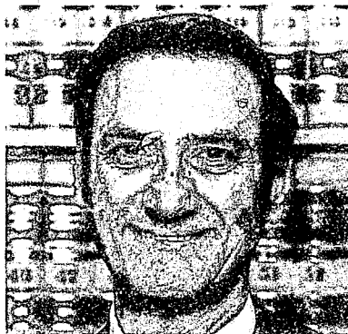
HONORABLE HOWARD L. SCHWARTZ Judge of the Municipal Court Oakland November 1980 - January 1981 (currently Judge of the Superior Court)