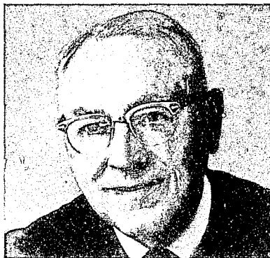
HONORABLE WILLIAM B. NEELEY Judge of the Superior Court Los Angeles February 1965 - February 1967