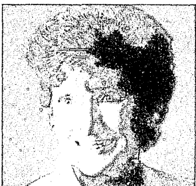
HONORABLE SARA K. RADIN Judge of the Superior Court Los Angeles Appointed September 1985 Present term expires February 1987