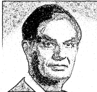
HONORABLE THOMAS KONGSGAARD Judge of the Superior Court Napa December 1979 - November 1980