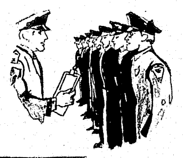
15For information on this research, see the various documents produced by Project STAR. American Justice Institute. Marin Del Rey, California.

Although there is general agreement that training should begin as soon as possible, little unanimity of opinion is evident regarding its objectives. Moreover, the average training course has yet to be validated in terms of imparting the appropriate knowledge, skills, and professional role behavior for serving in the position of a police officer. One can only hope that a relevant training program will be forthcoming from the monumental research effort presently underway. 15