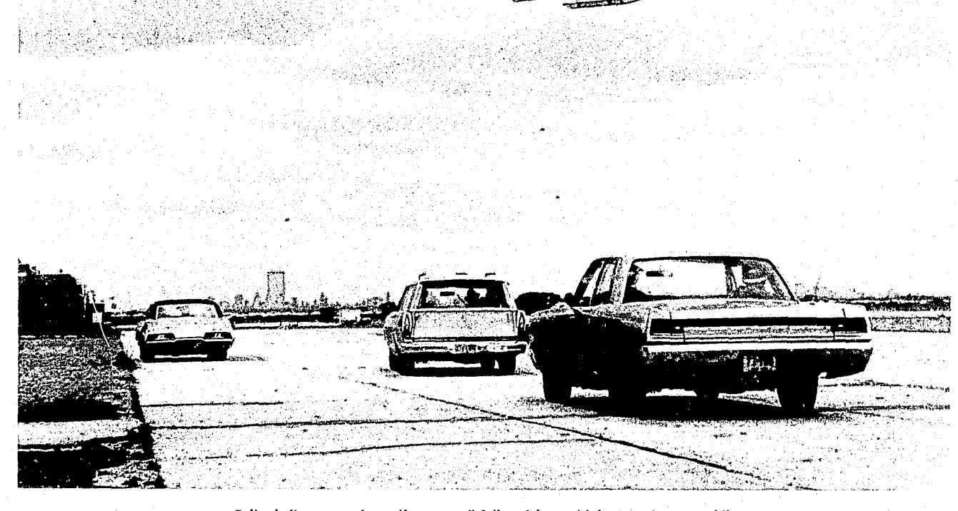
Police helicopter and cars (foreground) follow felons with hostage in automobile.

To operate escape and chase vehicles if necessary, and To function as a containment