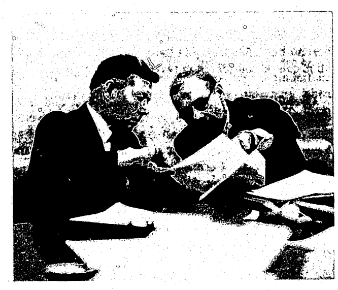
Meetings with local government officials by the planning staff facilitates acceptance and implementation of the regional criminal justice plan.

This monitoring should be on-going and permit a council to determine whether the particular program/ project should be rescheduled, allocated more resources, reoriented, cut back, restructured or terminated.