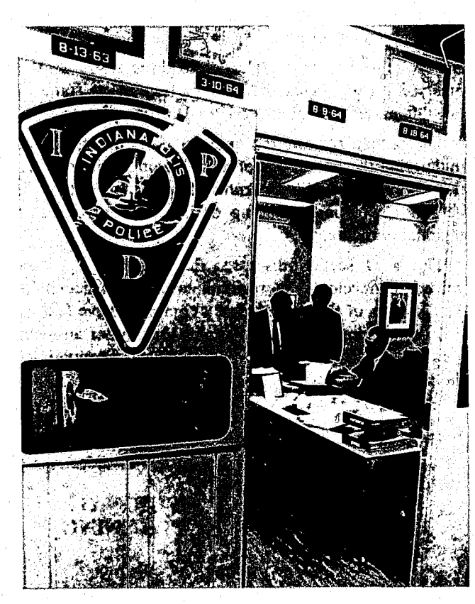
Planning and research functions in criminal justice agencies are not new, but regional criminal justice planning is a recent innovation.

offers the opportunity for a number of communities to pool scarce dollars to obtain effective planning as well as to combine efforts in securing financial and technical assistance from federal and state governments.