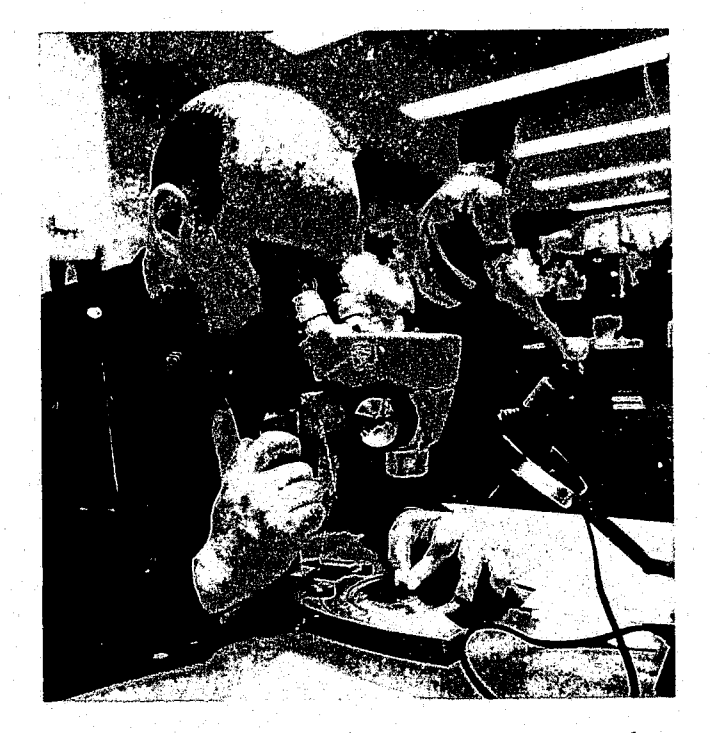
Regional planning provides an opportunity for developing intercommunity projects such as regional crime labs.