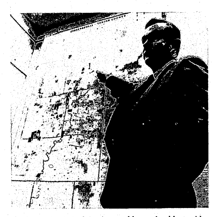
Analysis of criminal justice problems should consider the type of crime by areas within the region. Crime location maps are useful for this purpose.

Implementing these three projects will require almost three million dollars over a five year period. If adequate funding cannot be provided for the level of services necessary to attain the desired goal of reducing the juvenile addiction rate from 35 percent to 10 percent within five years, it will be necessary to consider alternatives to the above projects through which maximum results can be obtained within the resources available. This might result in elimination of one project based on comparative priorities, full funding of the other two, or even a whole new approach to the problem.