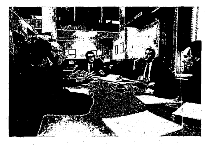
Determining the amount and sources of funding for projects is an important part of developing a criminal justice plan.

While many of these costs are difficult to measure, they collectively provide a means through which a procedure can be developed to evaluate the entire criminal justice system in the region.