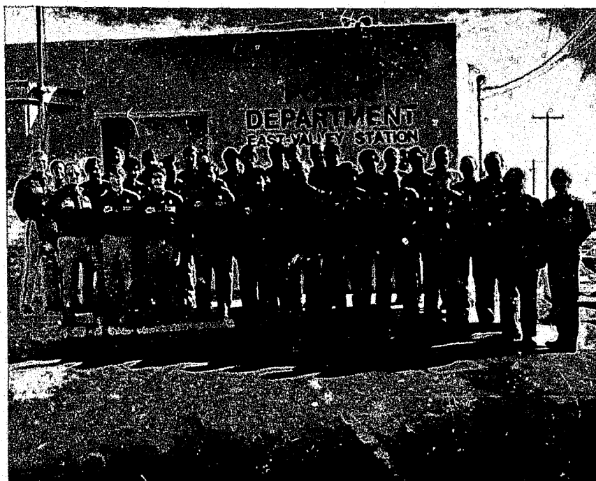
EAST VALLEY PATROL DIVISION #1 SHIFT