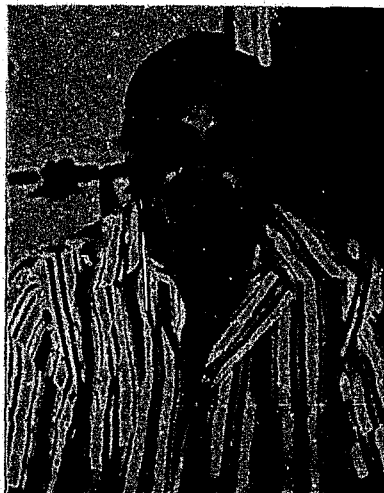
LT. FRANK F. RAGO

1 Lt. 1 Tab. Equip. Supvr. 1 Equip. Tab. Op. 5 Key punch Operators 1 Clk. Typ. II 1 Clk. II