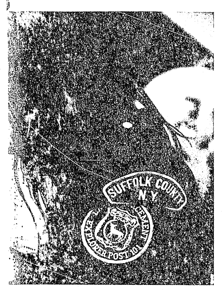
"Explorers' value to sponsoring law enforcement agencies can be specific and dramatic . . . ."