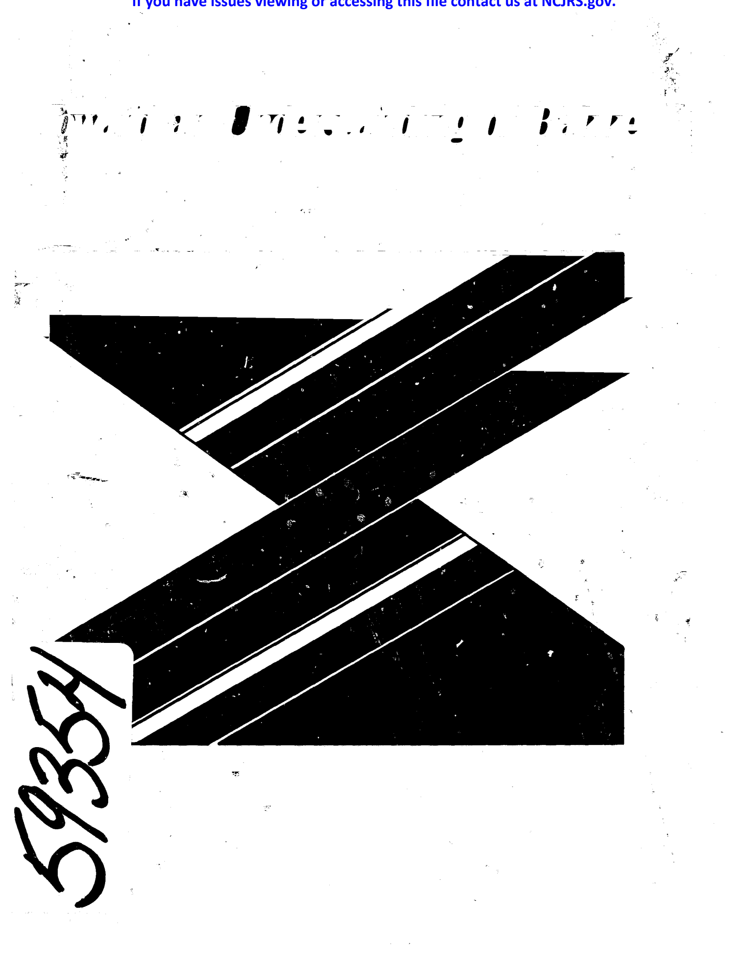
If you have issues viewing or accessing this file contact us at NCJRS.gov.