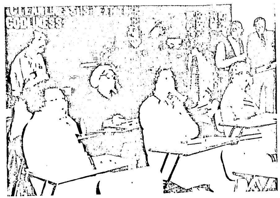
A public information officer discusses various aspects of crime prevention with neighborhood residents during a community development crime prevention program.

The block watch program is new to Birmingham, and because of its nature, it covers thousands of block-sized units. It takes a great deal of time and effort to establish; however, in those blocks which have subscribed to the program, the effect has been dramatic. In several instances when a neighborhood with a high crime rate created a neighborhood block watch, the rate actually dropped to zero. Such figures effectively demonstrate that the program does work and that neighborhood and citizen involvement does pay high dividends both to the community and the police department. It reduces the fear of crime-people know what's going on in their neighborhoods because they have the facts at hand. Rumors have no chance to grow. The community regains its vitality because the fear of the unknown is no longer present. The unknown has become a known entity with which one can deal.