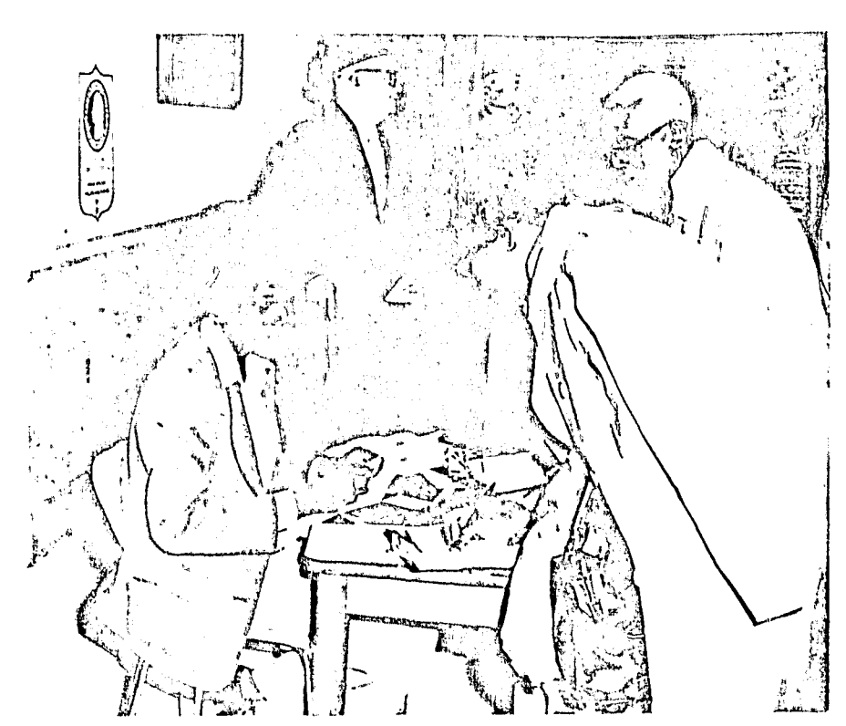
Residents of local neighborhoods sign in at the information desk during a community-level crime prevention program.

Another existing agency within the city government is the citizen participation program. Under this program the city is divided into 21 major communities which are subdivided into 90 neighborhoods, with several neighborhoods comprising a community. Elections are held at the community and neighborhood level, with individuals. from these respective groups running for the offices of president, vice-president, and secretary. The citizen participation program functions through three committees, one of which is the Citizens Advisory Board which consists of the presidents of all the citizens' community committees. This board maintains a standing committee which parallels those of the mayor-council form of government in the city. The board meets bimonthly and relays the concerns of these committees to the council. With the Police/Community Relations Committee, the board discusses methods of resolving problems that concern both the department and the various communities and brings these matters to the attention of the city fathers and the department. Just as information flows from the board to city government, information from the city government and the police flows to the board and its members.