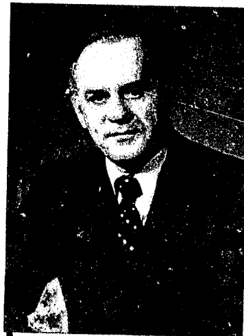
Governor Charles Thone

LAW ENFORCEMENT AND PUBLIC SAFETY NEBRASKA STATE PATROL