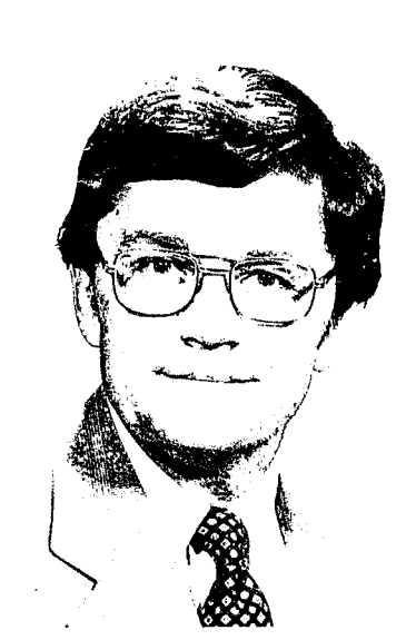
Special Agent Campane

Conspiracy prosecutions are attractive for a variety of reasons. First, the crime of conspiracy permits the intervention of criminal law at a time prior to the commission of a substantive offense. Courts have long recognized the uniqueness in the criminality