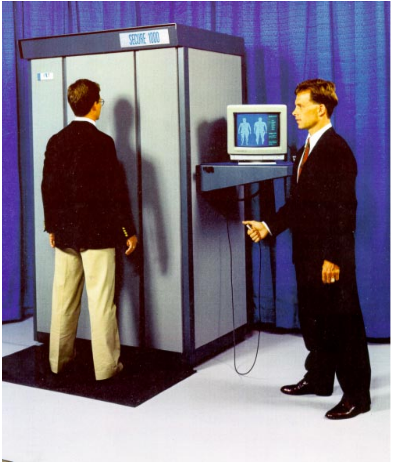
Figure 15. X-ray explosives detection system for personnel, Rapiscan Secure 1000