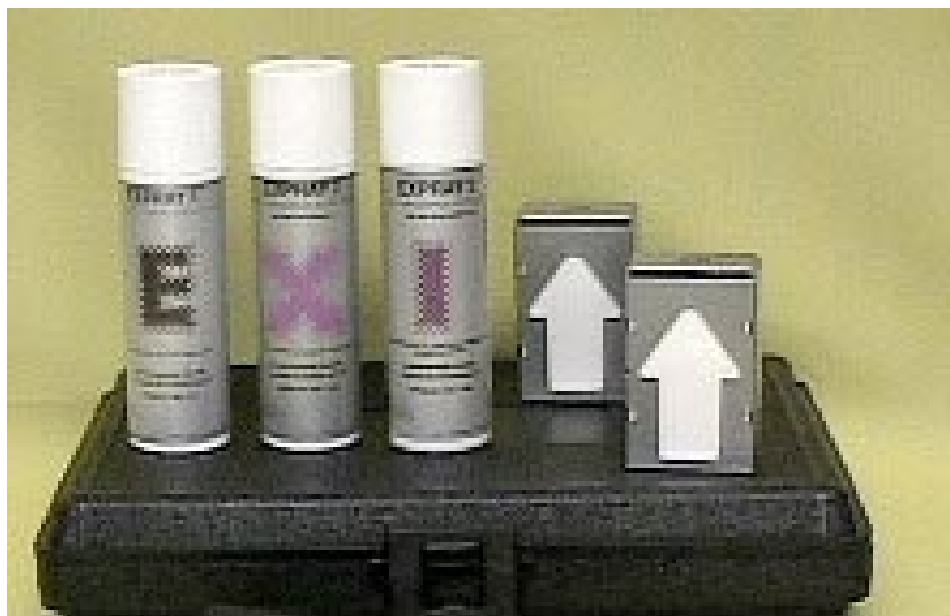
Figure 13. Photo of the EXPRAY Field Test Kit for explosives

Initially, a suspected surface (of a package, a person's clothing, etc.) is wiped with the special test paper. The paper is then sprayed with EXPRAY-1. The appearance of a dark violet-brown color indicates the presence of TNT, a blue-green color indicates the presence of DNT, and an orange color indicates the presence of other Group A explosives. If there is no reaction, the same piece of test paper is then sprayed with EXPRAY-2. The appearance of a pink color indicates the presence of Group B explosives, a group which includes most plastic explosives. If there is still no reaction, the same paper is then sprayed with EXPRAY-3. The appearance of pink then indicates the presence of nitrates, which could be part of an improvised explosive. If EXPRAY-2