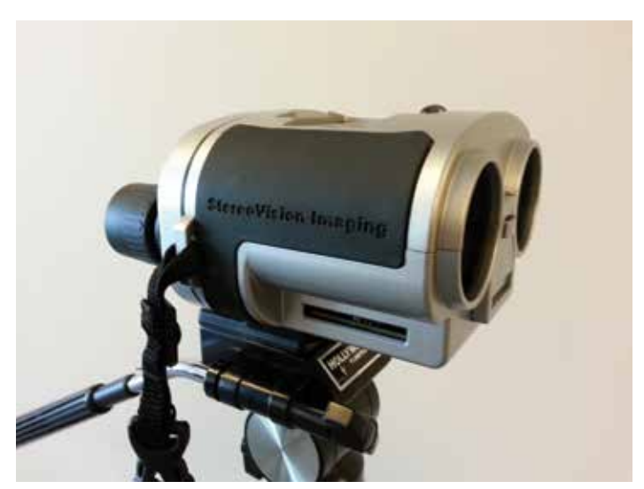
3DMobileID Long-Range Facial Recognition Binoculars by StereoVision Imaging

Assessment of Gun Safety Technology. The Center has conducted a technology assessment and market survey of existing and emerging gun safety technologies for law enforcement and personal use applications. The assessment examined smart or personalized technologies implemented into firearms that prevent anyone other than an authorized user from firing it, thus improving gun safety. Example smart gun technologies included proximity devices, such as